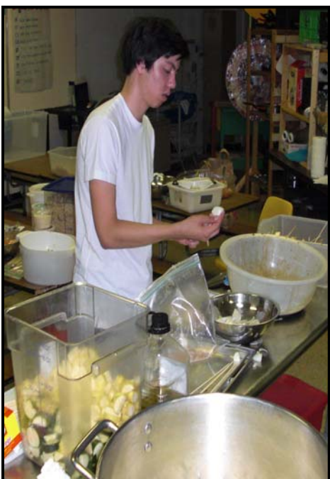
UNI IRON CHEF?

University City High School Graduation Day!! June 18th, 2009!! Temple University Congratulations to all our graduates!!